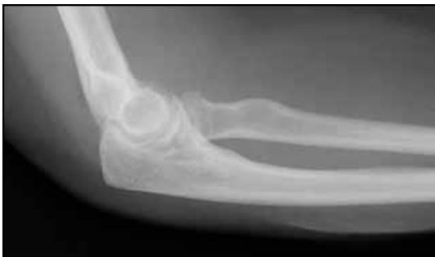
FIGURE 1: Preoperative X-ray