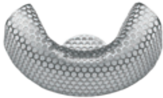
224-0030 Anterior Ridge Form™ Mesh