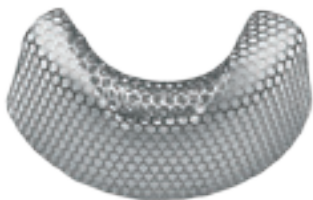
224-0033 Anterior Ridge Form™ Mesh