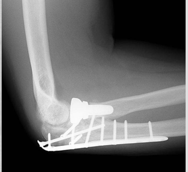
Distal humerus plates