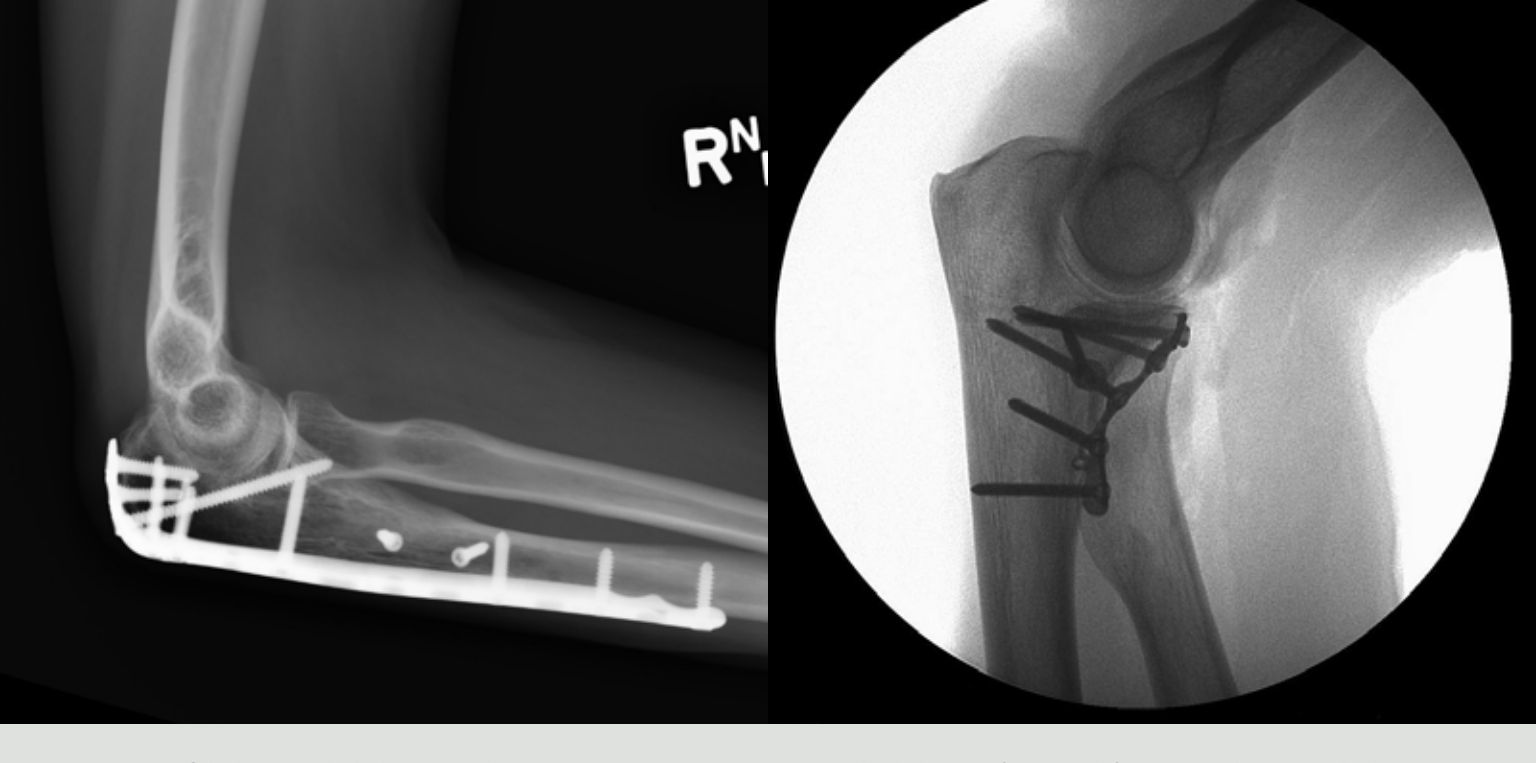
9-hole extended olecranon plate