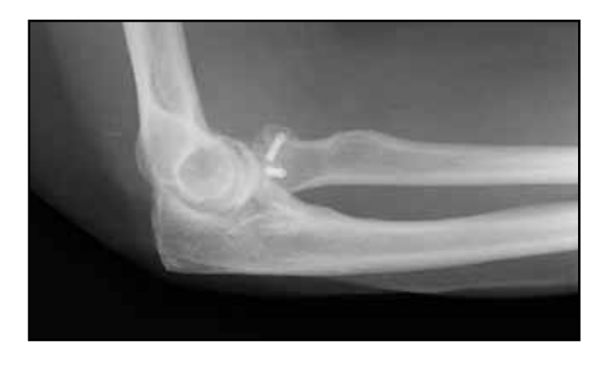
FIGURE 2: Postoperative X-ray