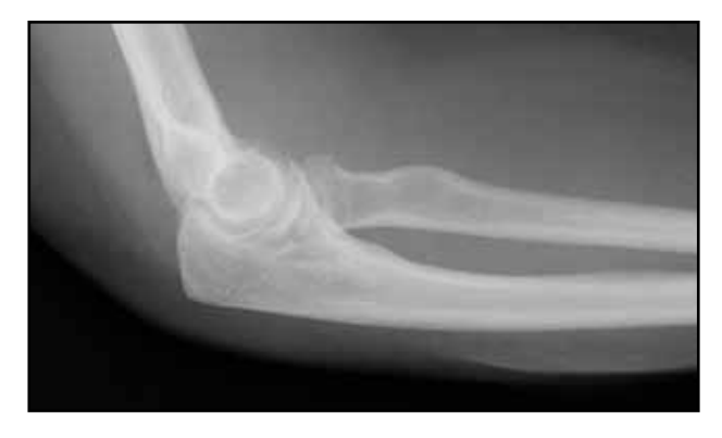
SPF70-06-A Effective: 3/2012 © 2012 Acumed® LLC