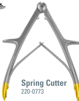
Spring Cutter 220-0773

Rx ONLY FEDERAL LAW (U.S.A.) RESTRICTS THE DEVICE TO SALE BY OR ON THE ORDER OF A PHYSICIAN