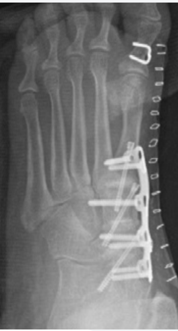
Figure 3 & 4:

Initial postoperative AP and MO x-rays demonstrating the medial column fusion with the VERSA plate as well as a staple for the Akin bunionectomy. The intermetatarsal 1-2 angle is now reduced.