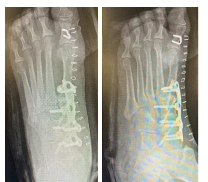
Figure 6 & 7:

Initial postoperative lateral x-ray demonstrates appropriate hardware placement. The patient is non-weight bearing in a posterior splint.