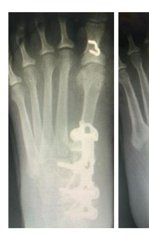
Figure 9 & 10

2.5 weeks postoperative lateral x-ray. Callus bridging is noted across the medial column fusion sites.