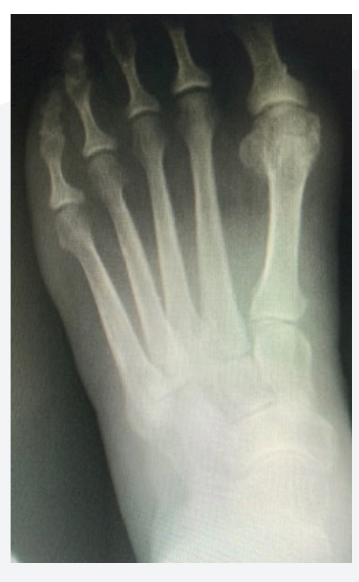
Figure 1: Preoperative AP x-ray demonstrating a moderate bunion deformity and arthritic changes to the left NC joint.

She is a fairly healthy female with her PMH being restless leg syndrome, IBS, HTN, HLD, and GERD. She does not smoke or use recreational drugs and rarely drinks wine. She works for the government and is on her feet frequently at work.