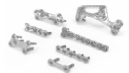
ExtremiLock Foot Plating System™