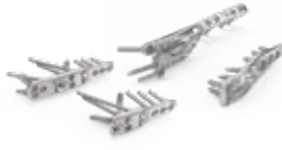
ExtremiLock Ankle Fusion Plating System™