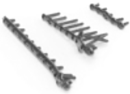
Ankle Plating System