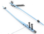
Fibula Nail 2 System