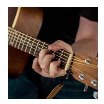
Playing an instrument