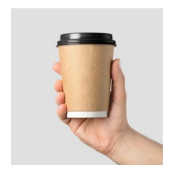
Holding a cup

Examples include but are not limited to: