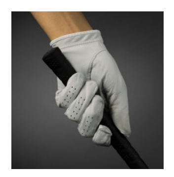
Gripping a golf club